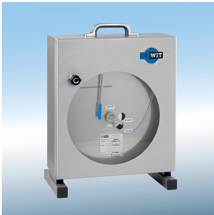
St. Steel AISI 316 Case 12" Chart Recorder De Wit model 4870SS